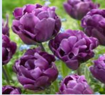
Tulipa double 'Alicante'

www.ashkeys.co.uk E: plant@ashkeys.co.uk