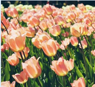
Tulipa single early 'Apricot Beauty'