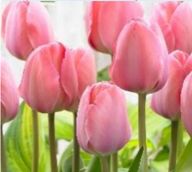
Tulipa darwin 'Van Eijk'

www.ashkeys.co.uk E: plant@ashkeys.co.uk