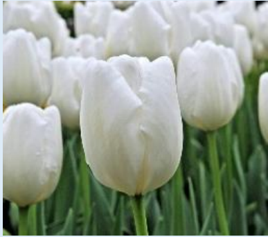
Tulipa triumph 'White dream'