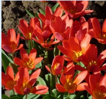
Tulipa kaufmanniana 'Scarlett baby'

www.ashkeys.co.uk E: plant@ashkeys.co.uk