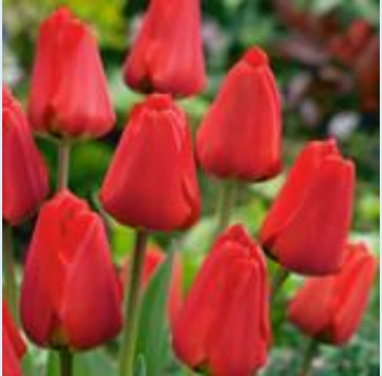
Tulipa darwin 'Apledoorn'

www.ashkeys.co.uk E: plant@ashkeys.co.uk